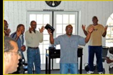
Men's Retreat Alhatti