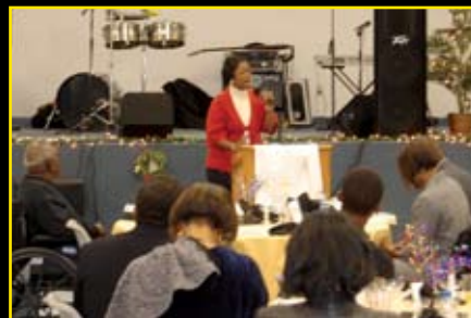
New Year's Eve