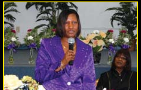
First Lady Pastor's Appreciation