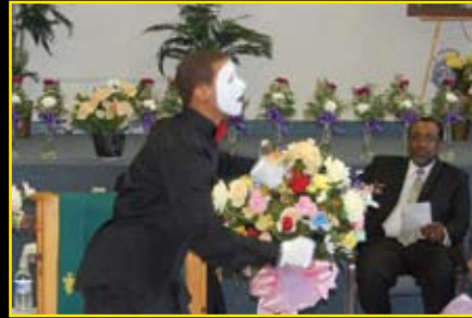
Mime Dancer Pastor Appreciation