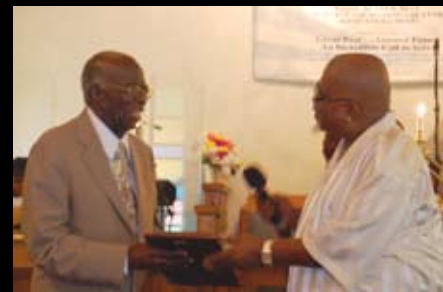
Men's Day Retreat Award