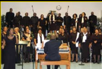
Musical Workshop Concert