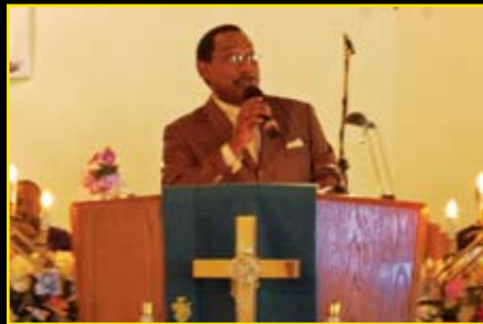
MC For Men's Day Program