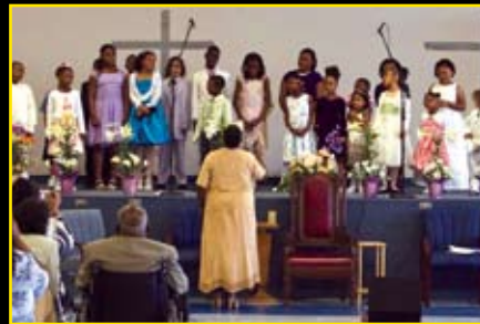
Sunday School Easter Program