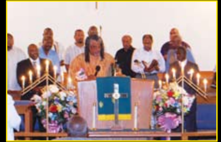
Men's Day Program