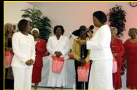
First Lady's Day of Elegance