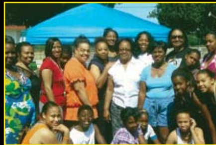
WMS '5k Walk