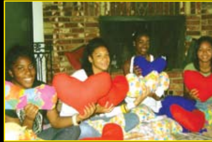
Daughters of Destiny - Pillow Making