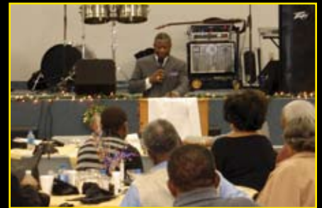
New Year's Eve