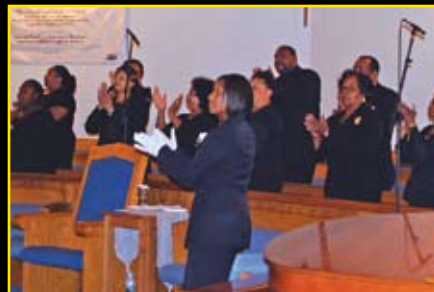
Annual Usher Day