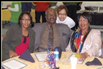
New Year's Eve