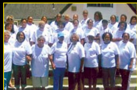
Women's Ministry Alhatti Retreat